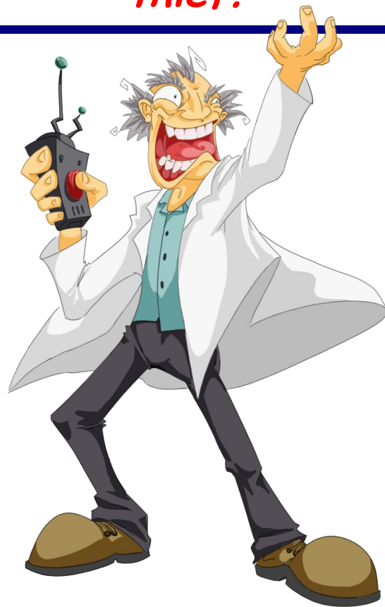
Professor Sig Figs